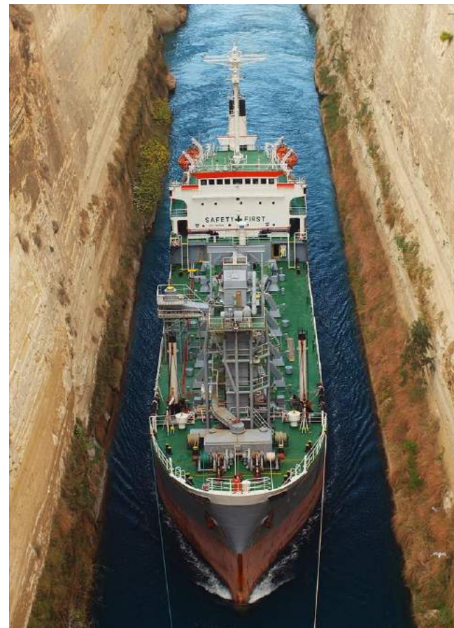
Eviacement IV in Corinth Canal